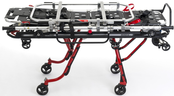
MONDIAL trolley plus stretcher ■